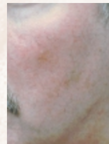
After one treatment

and your physician will discuss your options to properly manage any discomfort from the treatment. There should be no lasting post treatment discomfort.